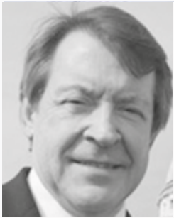
Sir Roger Gifford SEB and Former Lord Mayor of the City of London, continue p. 6