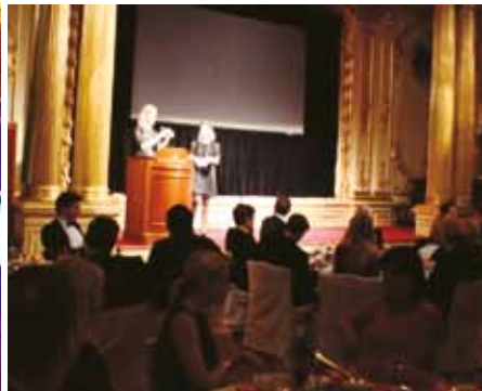
The BSCC Raffle—Thank you to all of our Raffle Sponsors