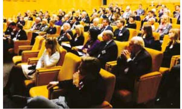
The guests listening to the panel in "Stockholm" at Grand Hotel

Almost 300 people celebrated the BSCC's anniversary on 3 November. We would like to thank all of our guests, Table and Raffle Sponsors for making this a wonderful and memorable evening!