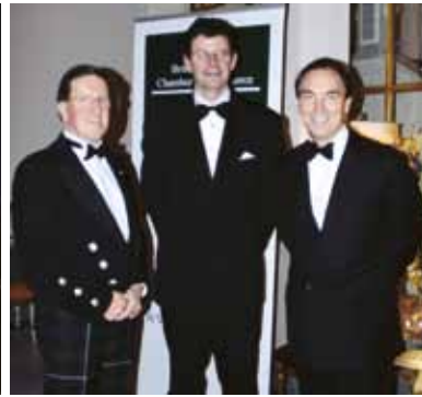
Sir Alan Parker, H.E. Ambassador and the Rt Hon Lord Robertson of Port Ellen