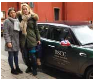
Follow us on Instagram