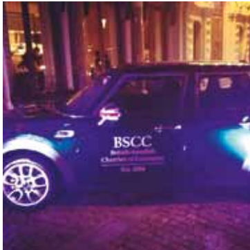
The BSCC MINI in cooperation with Bavaria Stockholm