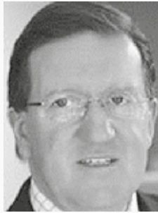
The Rt Hon Lord Robertson of Port Ellen Former Director General of NATO and Former Minister of Defense, continue p. 8